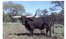
PPF Gun Maker