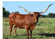
HR WHIZ BANG