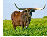
J.R. GRAND SLAM