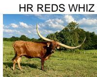
HR REDS WHIZ

Total Horn: 125.8750 on 10/07/2023 TTT: 83.7500 on 03/07/2024 Base: 15.0000 on 03/27/2019