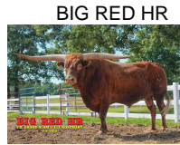
BIG RED HR